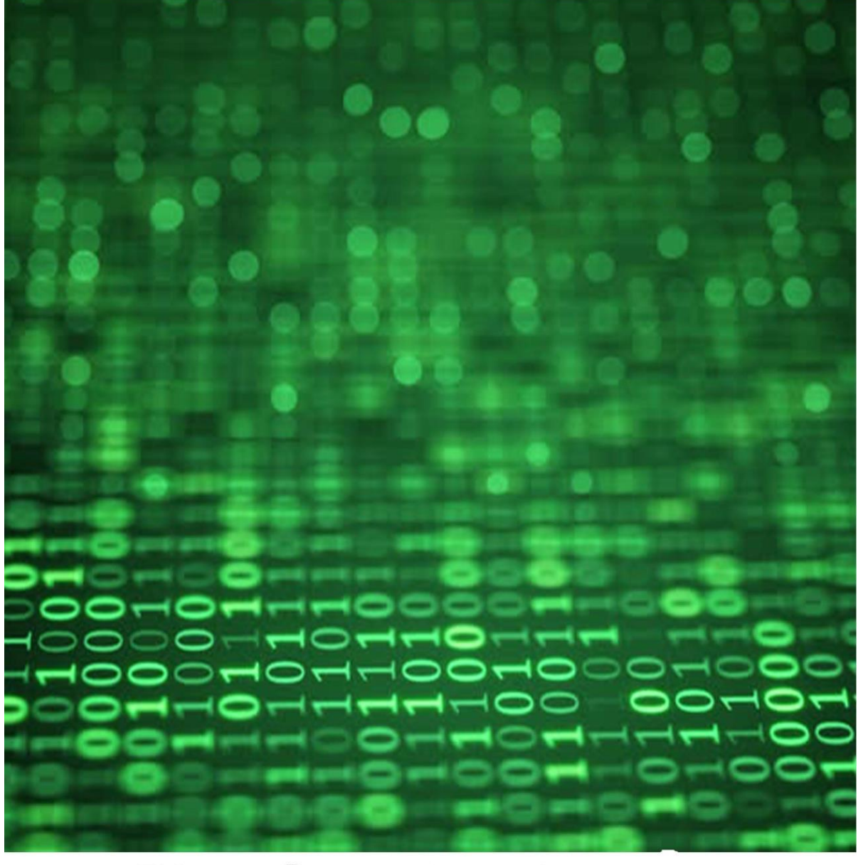
Volume-7, Issue-2, October - December 2021